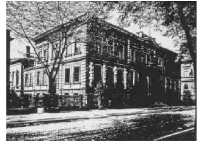
Dept. of Physiology, Univ. of Wuerzburg, designed by Adolf Fick in the 1870ies

28 hrs Pathophysiology lecture , e.g. Anemia; Leukemia; Bleeding disorders; Renal failure; Renal artery stenosis; Arteriosclerosis; Arthritis; Osteoporosis; Motor system; Adrenal failure; Pulmonary emphysema