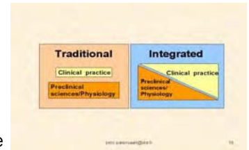
Fig. 1. Different approaches to introducing physiology in traditional and integrated curricula

Medical education is available in five universities in Finland: Helsinki, Turku, Tampere, Kuopio and Oulu. While the core of physiology is common and well defined in all units, there flourishes greater academic freedom in the practice of teaching. Generally, there are two basic strategies for teaching physiology, "independent" and "integrated" strategy. Independence means teaching and learning bodily functions autonomously in specific physiology courses. Integration means incorporating physiology to medicine and clinical practice right from the beginning of medical studies. Currently, only Tampere has an integrated curriculum and Oulu a traditional, independent one. Thus, the mixture of the two basic strategies ("hybrid") seems to be the most common approach to teaching medical physiology in Finland.