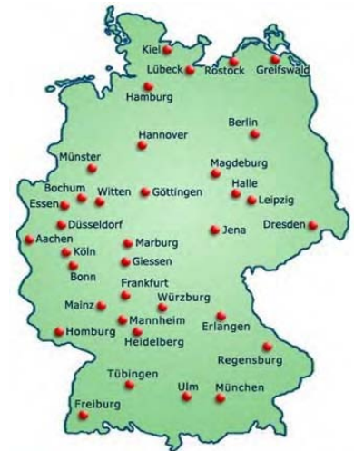
The 35 Medical Faculties/Schools of Germany (2004)

28 hrs „Integrated“ Seminars (groups of 20): Case-oriented (joined by clinical teachers)