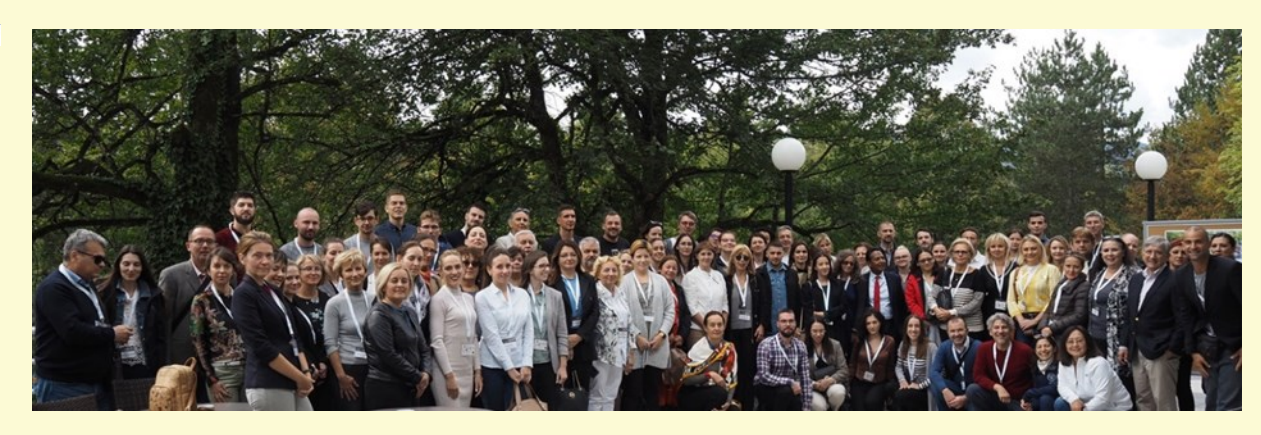
Picture 2. 3<sup>rd</sup> Regional Congress of Physiological Societies and 5<sup>th</sup> Congres of the Croatian Physiological Society, 22-24 September 2022, Plitvice Lakes National Park, Croatia.