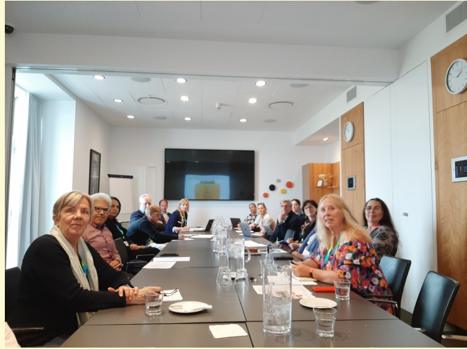
FEPS general assembly