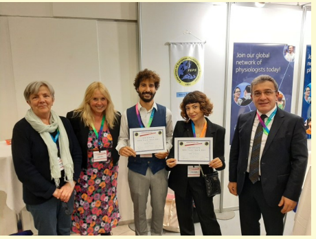
FEPS Travel award ceremony