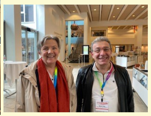
Old and new Secretary General